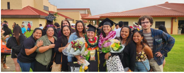
Head Start Teacher College Graduation