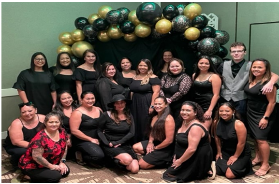
Early Head Start and Head Start Staff